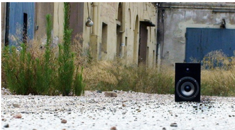
Magdi Mostafa, Soundscape: Can Ricart , Multi-channel Sound Installation, Barcelona 2009.

In his site-specific sound installations or interventions, Magdi Mostafa questions spaces and attempts to reveal their inherent, yet invisible, energy. While bringing these remnants and traces to life, he investigates the historical, social or economic values embedded in the layers of objects and places. Mostafa's sensorial environments are activated by the energies and bodies of the viewers who navigate the artist's labyrinthine installations, which explore the flux and reflux of sound. In this conversation, which took place in September 2015 during the Biennale de Lyon, Mostafa reflects on how uncertainty and chemistry play a vital role in his practice, enabling permeation between himself, the public, and sound. He also addresses sound's capacity to unearth lost feelings and images, and its potential to create spiritual experiences within exhibitionary frames that tap into the tactics of performance.