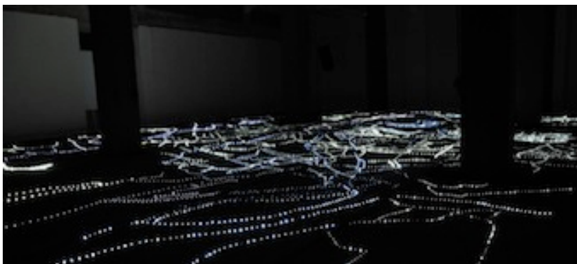
Magdi Mostafa, Surface Of Spectral Scattering , multi-channel sound and light installation, 2014

MM: In general, yes. For example, the number of post-graduate courses in Arabic that include new media arts at the faculty of art education in Helwan University is increasing. The German and American universities also contribute to this dissemination. International exchanges, as well as an enhanced access to Internet and social networks, have encouraged the transmission of knowledge around new artistic practices. But there is no governmental support. After the revolution, the quantity of exhibitions decreased and there have been less financial opportunities to produce artworks. The lack of academic research and writing is also an issue: the theory-based art criticism we currently have is a sort of 'protective umbrella'. Some young artists wait to be approved by this umbrella. I personally prefer to do without it.