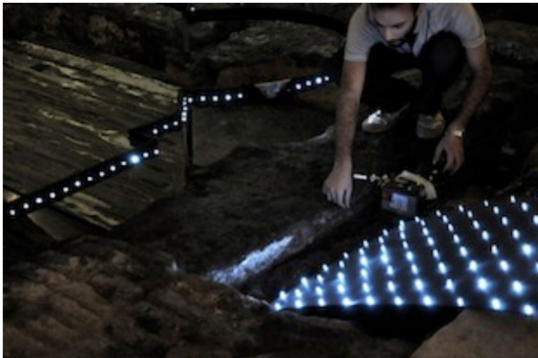
Magdi Mostafa, Transparent Existence , (light testing), 2010.

MM: In Cairo, the piece was shown in a 'street' context in an old garage converted into an art space. There was a high ceiling, so we built stairs five meters above the work. When climbing up, you could not see the artwork until you had reached the top. There you encountered an aerial map of 'Cairo' spreading over 450 square metres. It felt as if you were flying. In Lyon, the setting was a cultural space – La Sucrière is an old sugar warehouse. Its ceiling is lower, so the staircase had to be smaller and the piece covered about 300 square metres. In the Biennale de Lyon, the exhibition time frame is also smaller but the public is bigger. I believe it is a positive risk to adapt the works and to have altered meanings. If you are always worried about something being lost then maybe you will never gain something new.