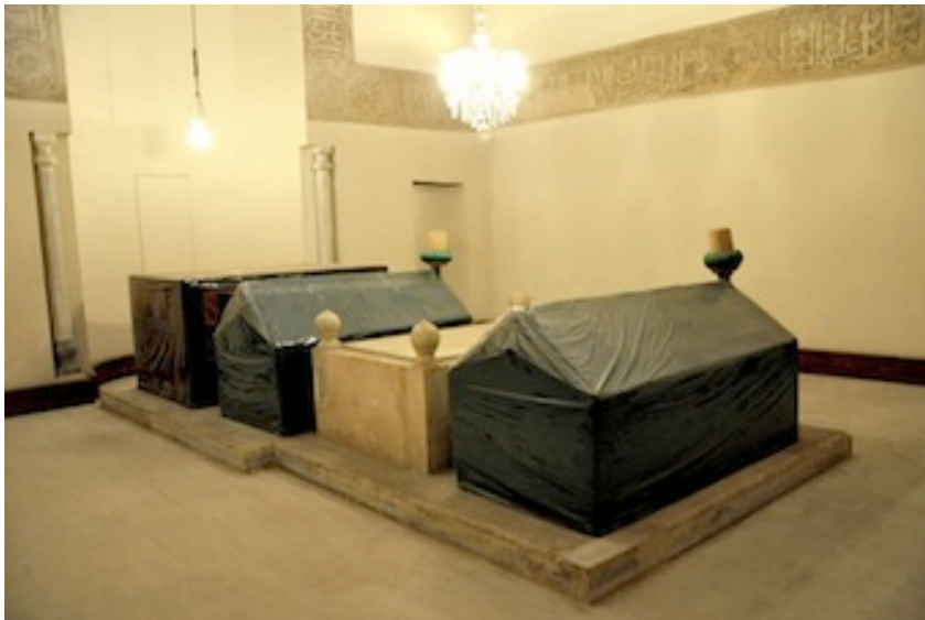
Magdi Mostafa, Transparent Existence , site investigations – Mawlawi Museum, Cairo, 2010.

MM: It is true – you never know who is coming and whom you will be meeting. It makes art a bit more important because it is more engaging and effective. In a museum you have borders limiting the experience of art and in a gallery (a professional interface) the public has the intention of seeing art. In the street, you get more honest feedback: the audience receives you without being mentally prepared.