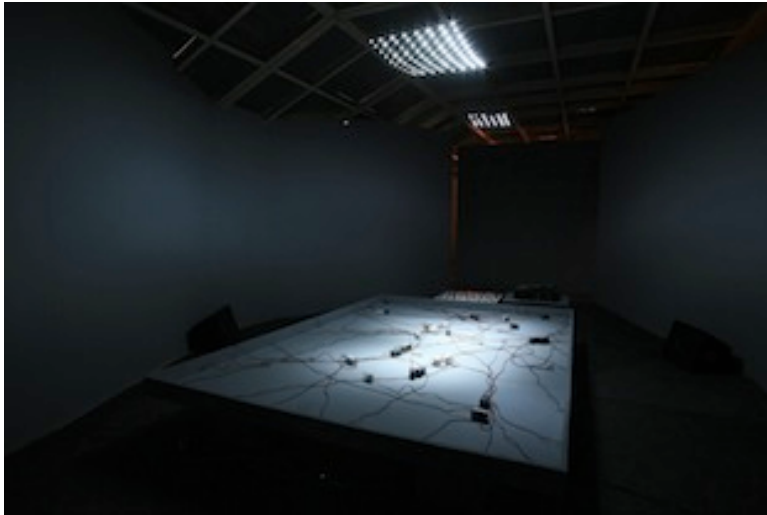
Magdi Mostafa, Sound Cells: Analog Orchestra , sound installation, 2009.