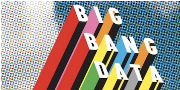
Big Bang Data © Morag Myerscough

On view at Somerset House, “Big Bang Data” is a major landmark exhibition about the big data explosion of the 21st century, which is radically transforming our lives.