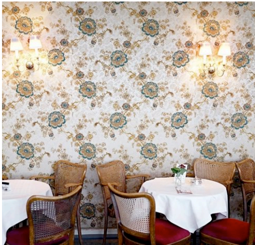
Candida Höfer, Tables (2016). Courtesy of Galerie Thomas Zander

Whether it's American politics or the buzz around the Supermoon, it's probably time to take a break away from all the uproar dominating our conversations on this side of the Atlantic and turn our attention towards good old Europe for a moment. Art enthusiasts, let's focus on the fourth-largest city in Germany: Cologne. Host to more than 30 museums and hundreds of galleries, it's always the perfect art getaway—now more than ever this week with the arrival of the Cologne Fine Art, which will feature highlights of all epochs of art and design history. This historic fair was founded in the 1970s, and today it's sure to catch some of the wave of success established by Paris Photo last week.