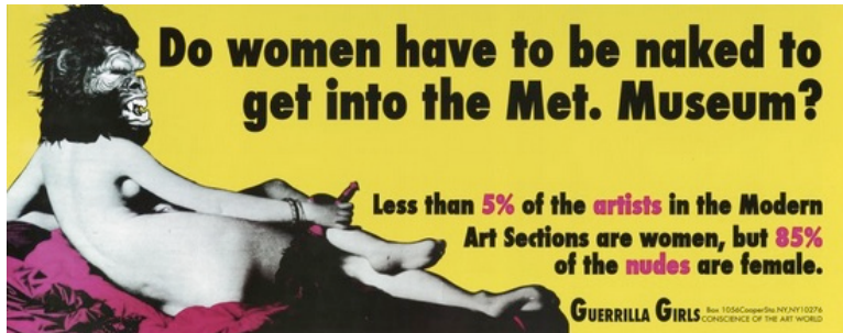
Guerrilla Girls, Do Women Have to Be Naked to Get into the Met. Museum? (1989). Courtesy of Museum Ludwig, Guerrilla Girls, guerrillagirls.com