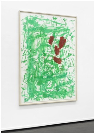
Georg Baselitz, Installation View.

Where: Galerie Buchholz, Neven-DuMont Straße 17, Cologne, Germany