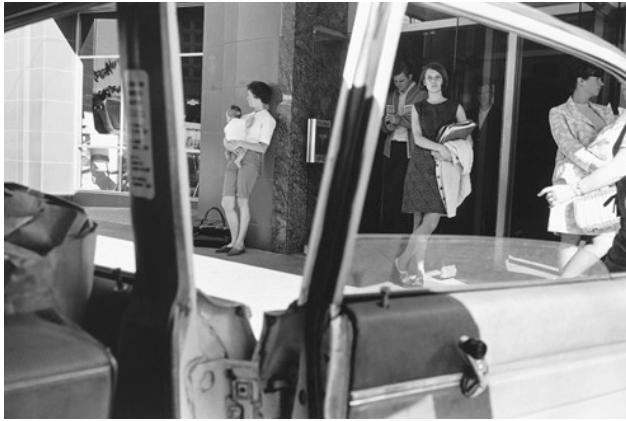
Lee Friedlander, Seattle (1967).

Exhibition: “Candida Höfer Observations” & “Lee Friedlander Street – The Human Clay”