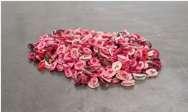
Installation view.

Where: Galerie Werner Klein, Volksgartenstraße 10, Cologne, Germany