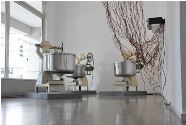
Magdi Mostafa, Installation view. Courtesy of Galerie Brigitte Schenk

Where: Museum Ludwig, Heinrich-Böll-Platz, Cologne, Germany