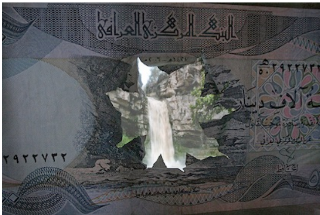
Walid Siti, Beauty Spot. 2011 Color print, wood panel, video in loop 250 x 450 cm