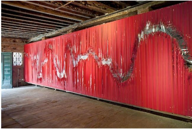
Walid Siti, Meso. 2011 Installation Meylar mirror, twill tape, nylon fishing line, wood 260 x 900 cm