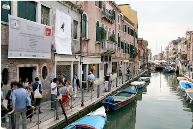
Venue of the exhibition Fondazione Gervasuti Fondamenta S. Anna (Via Garibaldi) Castello 995, Venice